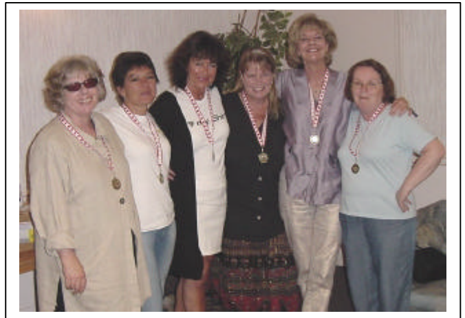
Edmonton's Favourite Daughters vs. The Gordons

For Sunday, Monday, Tuesday, and Wednesday results, see the CBF website.