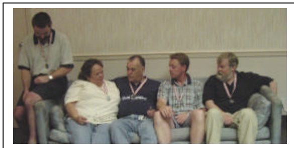
The Custead Team