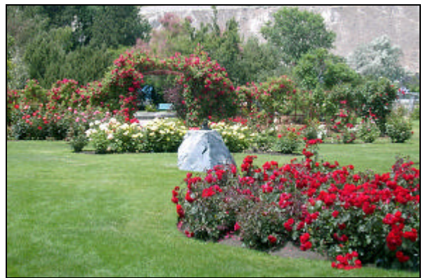
The Rose Garden in Bloom

With all the attractions in Penticton (from the Casino through the Peach on the Beach to the S.S. Sicamous) there is one little jewel not seen by many that is worth a few minutes of your busy schedule. Just west and a little south of the S.S. Sicamous (actually between the steamship and the driving range and mini-golf site) sits a small but elegant rose garden. This early in the season many of the blooms are still coming, but there is enough colour and enough sweet scent to make the crustiest declarer smile. Walk west down the sand or drive to the garden and take 15 minutes of quiet contemplation. It will make that last outrageous gaff by your partner fade into the insignificance it really deserves to be. People have often advised me to take time to smell the roses, but until I had an opportunity to spend time in a rose garden like this one, I really didn't understand what that expression really meant.