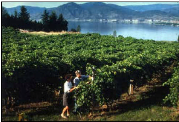
The Grape Harvest on the Highland

If Ogopogo comes into shore to share your lunch with you, make sure you have him stop long enough to pose for a picture. It isn't worth $2,000,000.00 any more, but it would certainly figure in your tournament highlights for years to come.