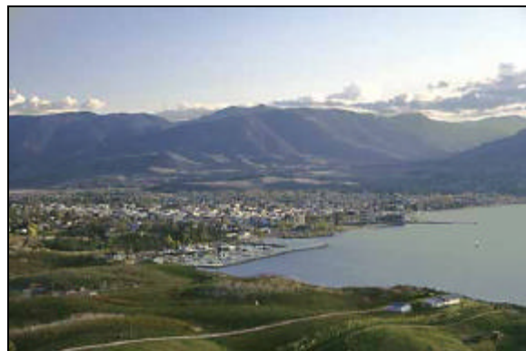
The City of Penticton looking down from the wine region east of the lake. All the water makes the desert bloom.