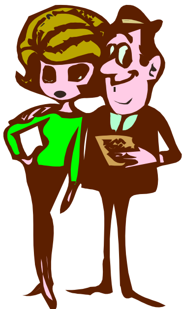
An “impish” pair!